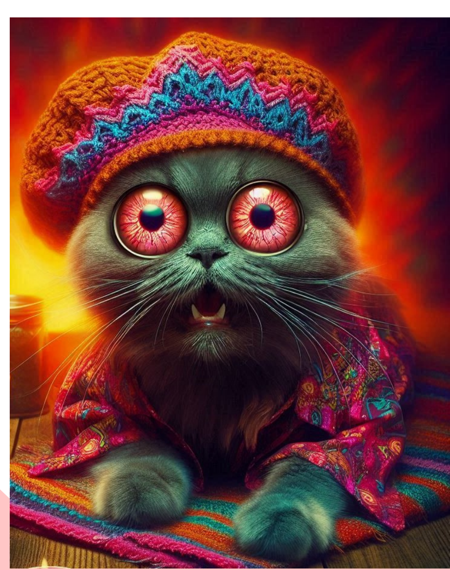
"Hippie Cat," DALL-E 3, 2024

Artificial Intelligence can Hallucinate!