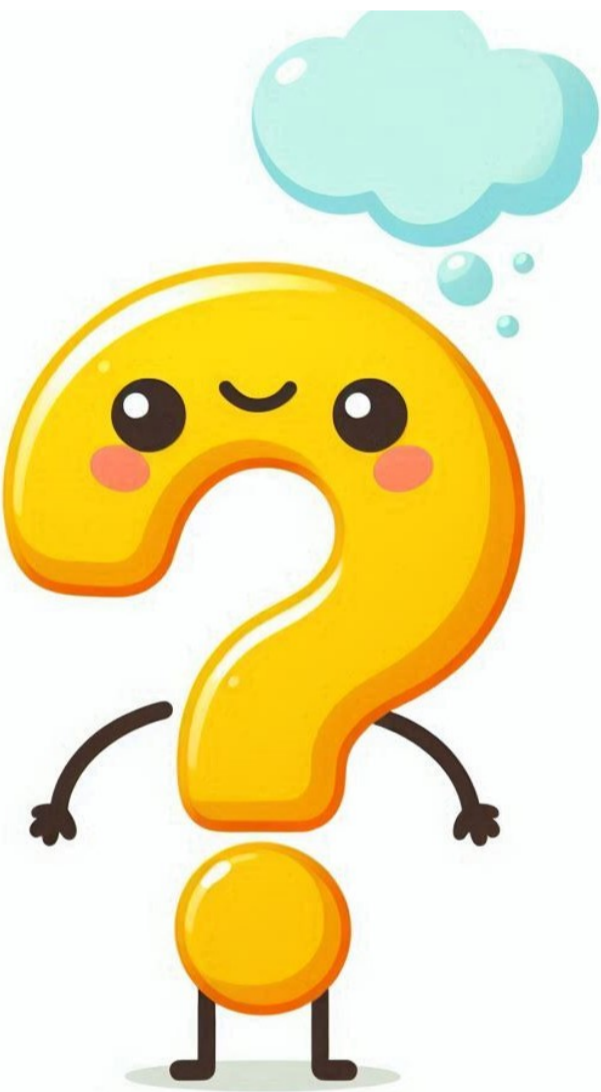
"Cartoon Question Mark." DALL-E 3, 2024